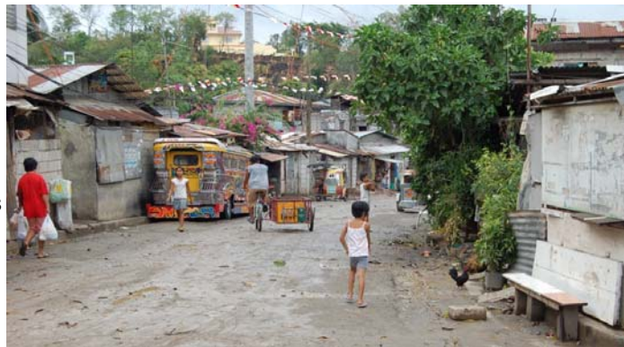
A typical street scene in Manila, Philippines

“The Spirit of the Lord is on me because He has anointed me to preach good news to the poor . He has sent me to proclaim freedom for the prisoners and the recovery