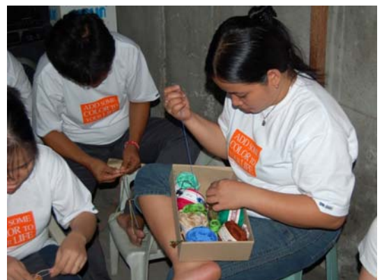
Filipinos creating bracelets for “Woven Joy” a micro-enterprise project in the Philippines that provides income for the poor.