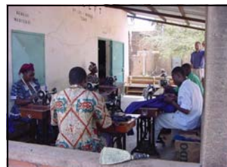
The Sewing Center Class working on the veranda at the Sewing Center.

In May, four people will be graduating from this program. We praise God for this exciting news! 🙏