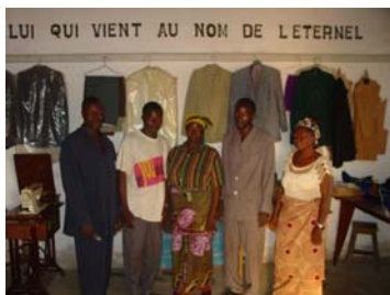
The Sewing Center team of workers.

The creation of employment for African people has been at the heart of LIAI from the beginning. People in rural settings need more to support their families than their meager gardens often supply. And as Africans move to urban centers for various reasons, they are often