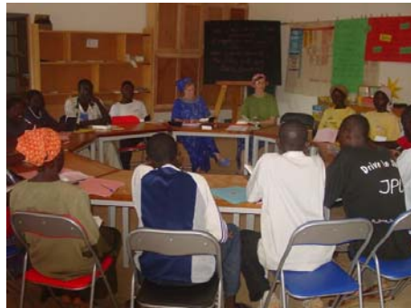
The “True Love Waits” Club meeting in the MRTC classroom with the new tables and chairs.

Because of the instability of the country, plans for the dedication of the Mike Retterer Training Center (MRTC) have been postponed from September 2006 to possibly the fall of 2007.