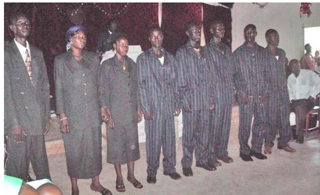
Graduation: The three Sewing Center graduates are on the left and the five Metal Fabrication Shop graduates are on the right

Sewing Center graduates three and the Metal Fabrication Shop graduates its first five students.